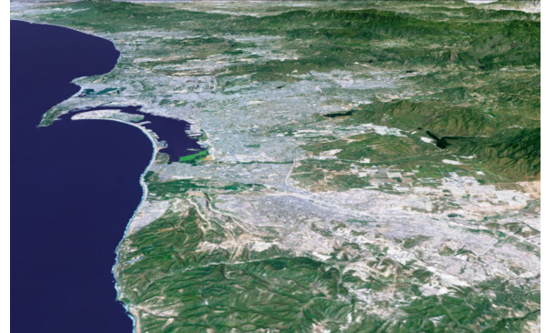
San Diego-Tijuana Landsat view

Hosted at the World Resources Simulation Center, we will begin by focusing on ten key issues: